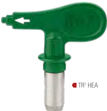
TR 1 HEA