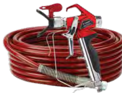
▶ The Elite 3500 comes complete with RX-Pro Gun, 517 TR1 Reversible Tip and 1/4" x 50' Airless Hose.