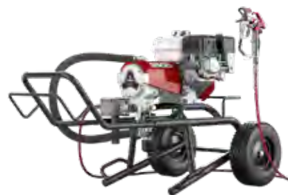
▶ Elite 3500 Low Rider