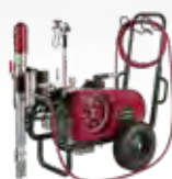
■ PowrTwin 6900 Plus DI Electric

Configured with a submersible foot valve designed for very heavy materials, including drywall mud.