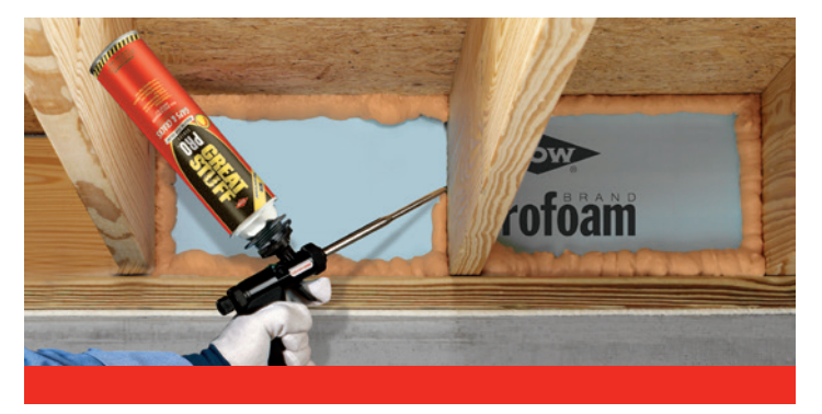
®™Trademark of The Dow Chemical Company ("Dow") or an affiliated company of Dow *Source: www.energystar.gov *Intended for use in residential application to maintain the continuity of an approved fire b

GREAT STUFF PRO<sup>™</sup> Gaps & Cracks is a gun-applied, expanding spray foam sealant for use all around the home. It is also recognized as a fireblock sealant.**