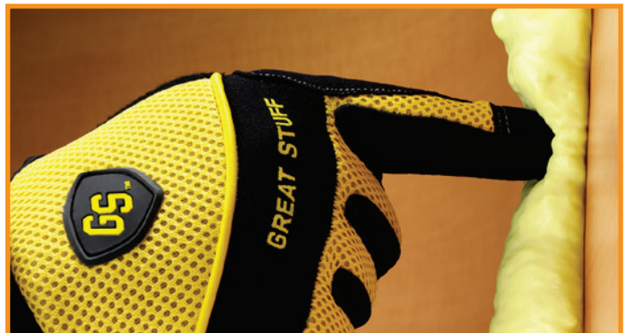
When cured, remains soft and flexible. Cured foam can be stuffed back into the gap without trimming.