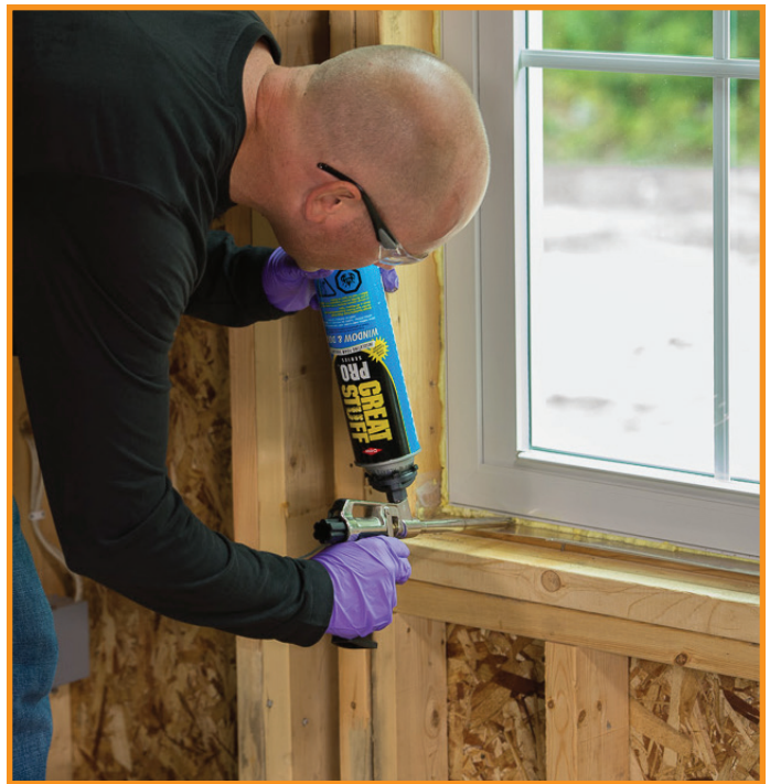
Window and their rough openings